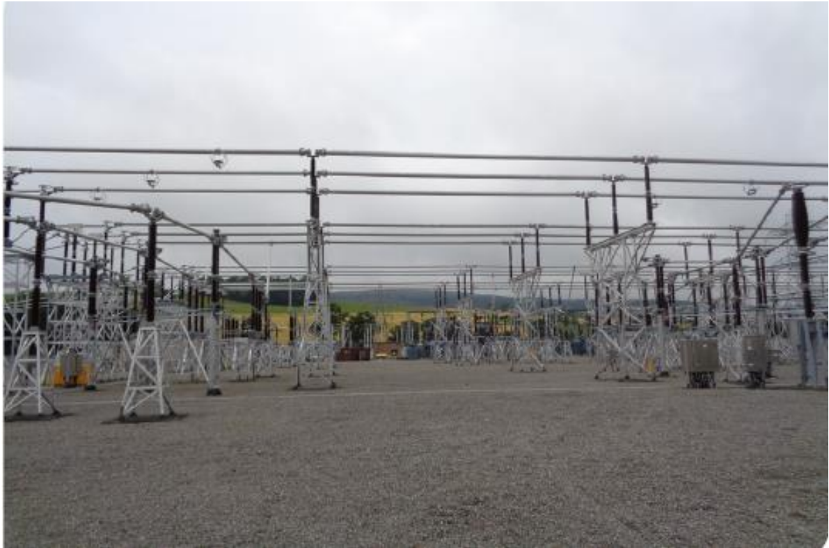
Plate 2.2: Example Switching Station (Indicative image)