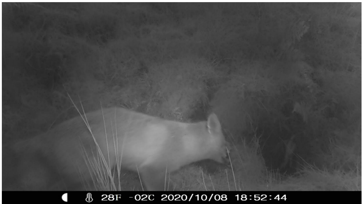
Plate C4: Image of fox