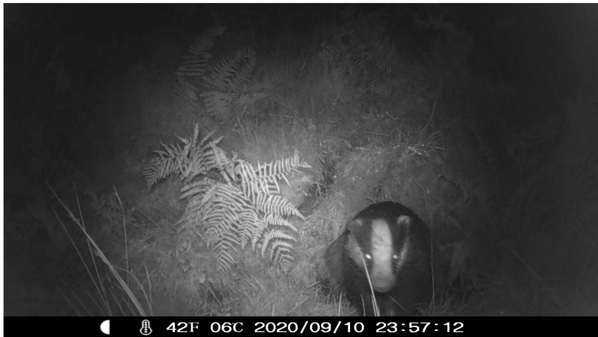
Plate C1:Image of badger emerging from sett entrance.