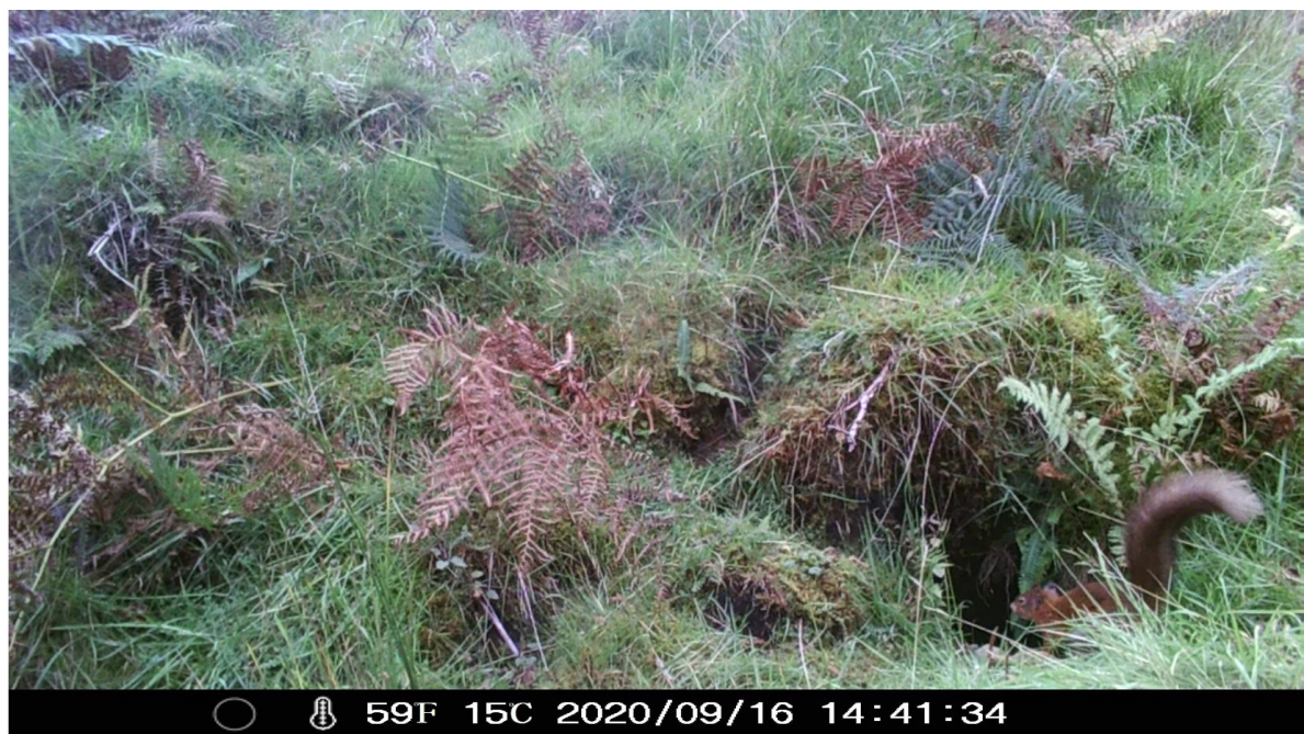
Plate C2:Image of red squirrel