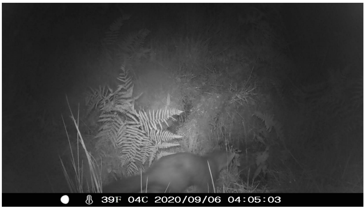
Plate C3: Image of pine martin