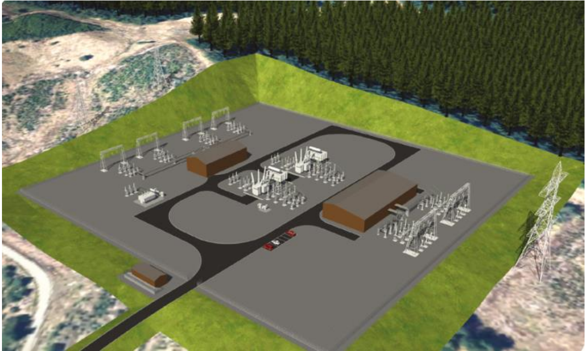
Plate 2.1: Proposed Creag Dhubh Substation (indicative drawing to illustrate substation parameters)

This substation is currently at the design stage ( Plate 2.1 ) and is being progressed in parallel to the Proposed Development. It will be the subject of a separate planning application made by SSEN Transmission under the Town and Country Planning (Scotland) Act 1997, as amended. The proposed substation will connect the existing Inveraray to Taynuilt 132 kV overhead line to the Proposed Development.